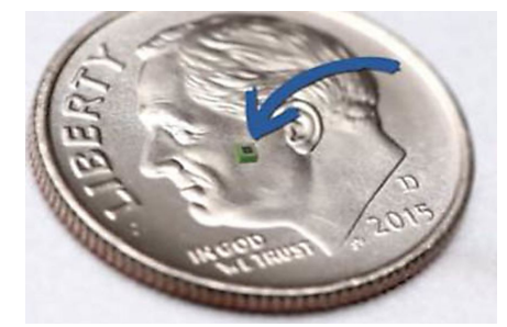
Tiny Device to be in 50 Billion Products by 2020 (Read Article) Banyan Hill Publishing