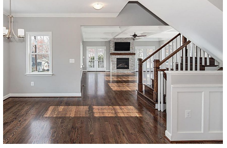
Hire a Pro: The Best Solution for Your Small Home Projects HomeAdvisor